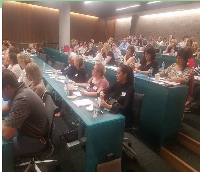
Great turn out!