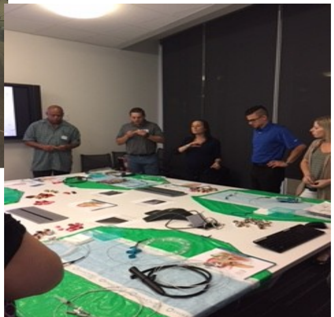
Break out Session