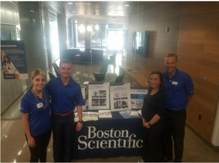
Boston Scientific Staff